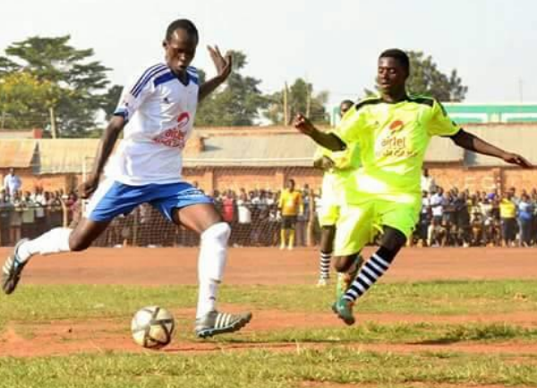
Above: The Boys team with Jerseys of Awama Biomass Energy. Top: Our U12 Boys'Team