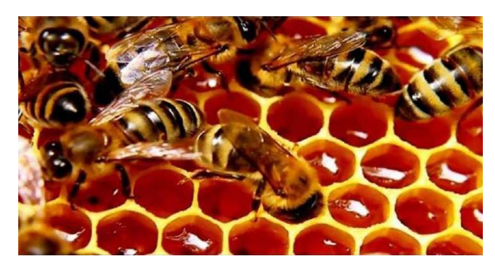
Figure 1. Honey on the honeycomb