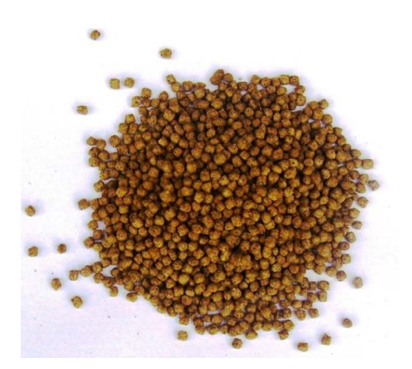
Chapter 6 – Feeds and Feeding the Fish